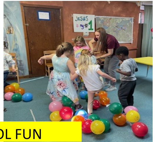
WEDNESDAY AFTER SCHOOL FUN